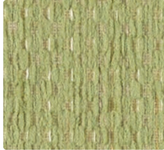
WC962-003 Grass Green