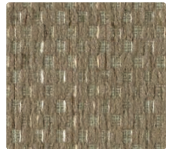
WC962-010 Blue Heron