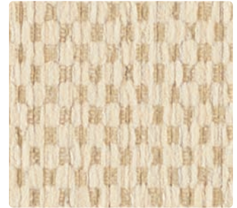
WC962-007 Snow Drift