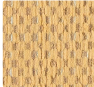
WC962-002 Morning Sun