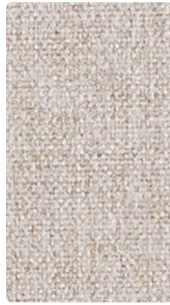
621-046 Light Grey