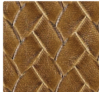
ML-002 Old Gold