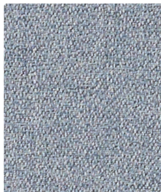
165-004 Blue Mist