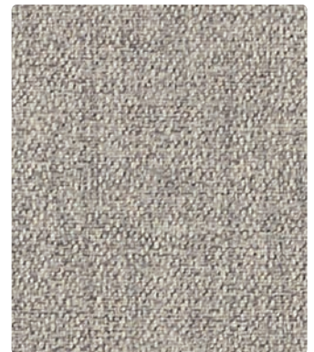
165-016 Gray Mix