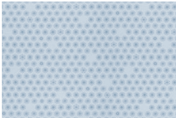
SPOKES – Approx. Repeat: 28.4" H, 24.89" V Random Match

Sunbrella® is a registered trademark of Glen Raven, Inc.