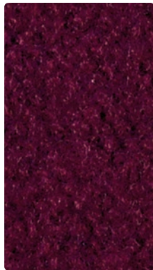
LC909-005 Red Violet

Reduced Environmental Impact GREENGUARD Gold Certified Bluesign® Approved