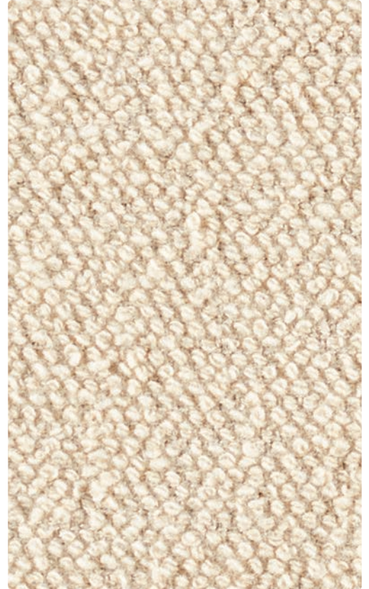
LC909-007 Sea Salt